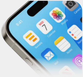
Stackably Customer App Access invoices, membership and community.