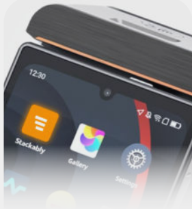
Free Smart Terminal Take in-person payments with no cost device.